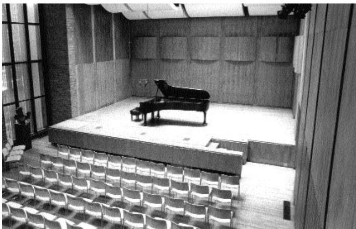
above: Edward M. Pickman Concert Hall 27 Garden Street