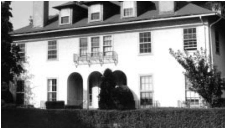
below: Recital Room N1 Rey-Waldstein Building 33 Garden Street